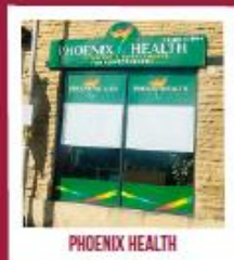
PHOENIX HEALTH 89A Scotland Road, Nelson, BB9 7HX