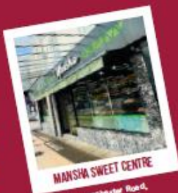
MANSHA SWEET CENTRE 66 Manchester Road, Nelson, BB9 7EJ