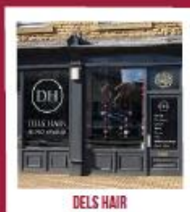
DELS HAIR 57-59 Cross Street, Nelson, BB9 7NQ