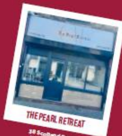
THE PEARL RETREAT 28 Scotland Road, Nelson, BB9 7JU