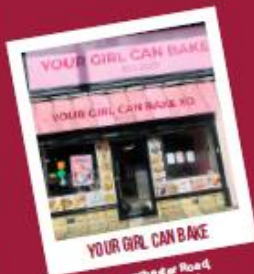
YOUR GIRL CAN BAKE 60 Manchester Road, Nelson, BB9 7EJ