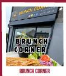
BRUNCH CORNER 3-5 Ripby Street, Nelson, BB9 7AA