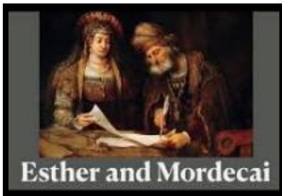
Esther and Mordecai

Please pass on any thoughts and ideas you may have about what you feel your child would benefit from knowing about this theme.