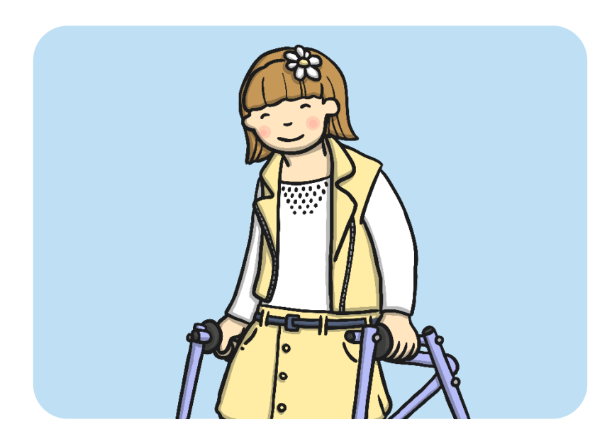
Lilly smiled kindly.